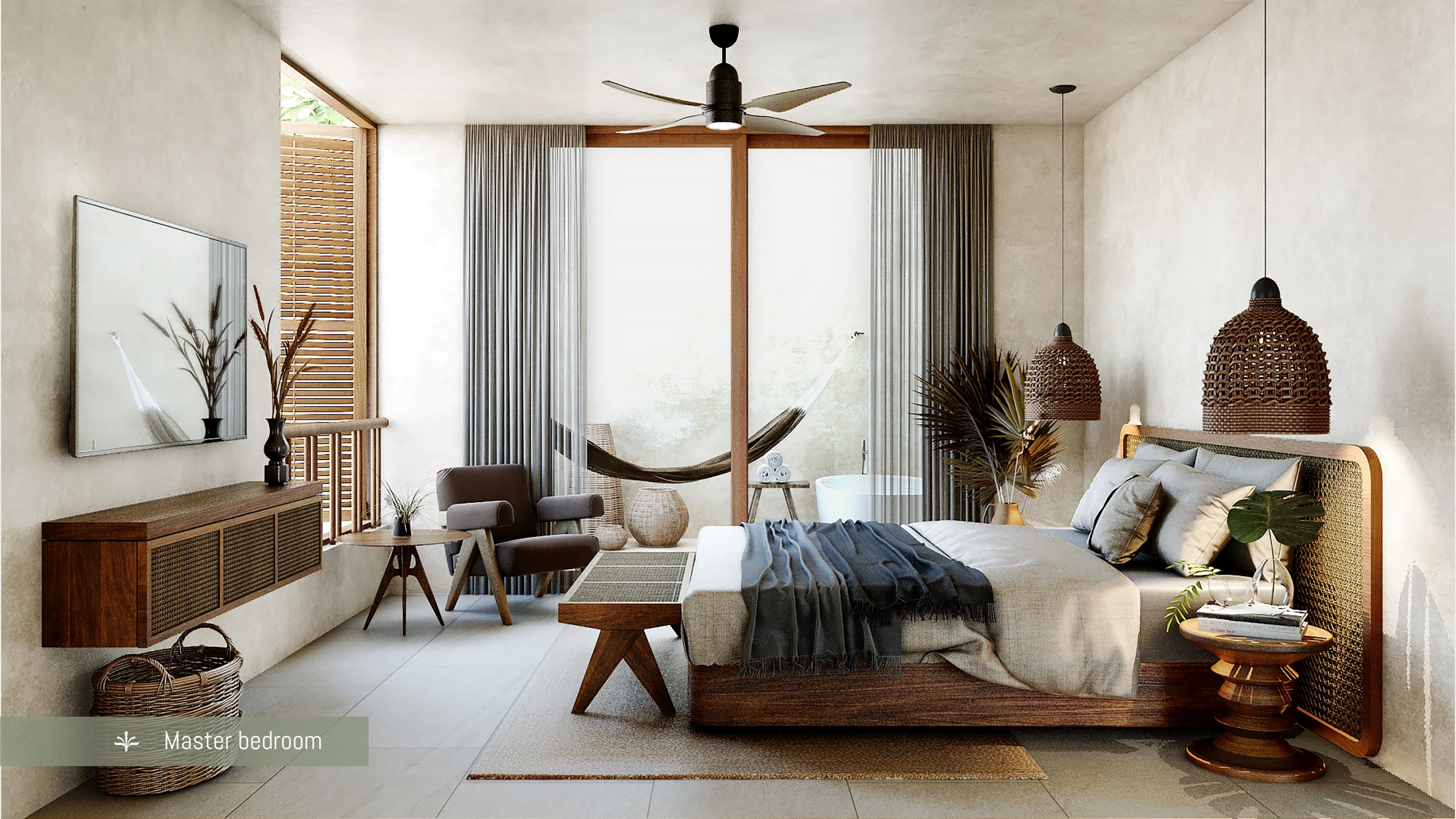
✿ Master bedroom