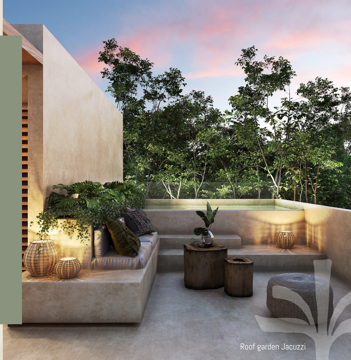
Roof garden Jacuzzi